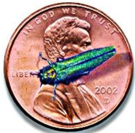
Emerald ash borer.

Invasive species pose a serious threat to the forests of Maine and possibly to the health of the woods in your backyard. By federal definition, an invasive species is an organism that is not originally from an area and causes harm to the environment, the economy, or human health. Invasive insects, diseases, and plants all have the potential to negatively impact your woods. Examples of invasive species already impacting the health of Maine’s forests include emerald ash borer, winter moth, hemlock woolly adelgid, and Asiatic bittersweet. Maine’s web portal, https://www.maine.gov/portal/about_me/invasives.html , provides a jumping off point to learn more about invasive insects, diseases, and plants.