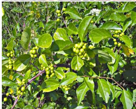
Asiatic bittersweet ripe and unripe fruit.