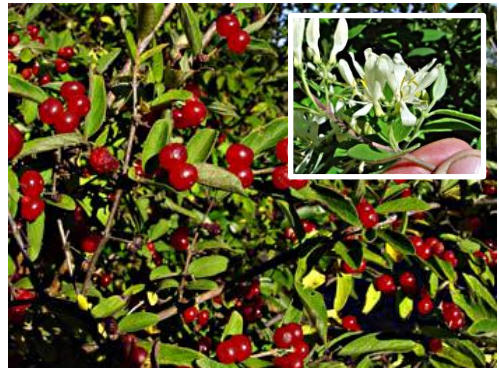
Morrow’s honeysuckle flowers and fruit.

Invasive shrub honeysuckles move into new areas quickly and form a dense layer that shades the ground. They prefer open locations but tolerate moderate to full shade. In addition, they grow in soils that range from moist to very dry. A short time ago people promoted them for ornamental use and erosion control.