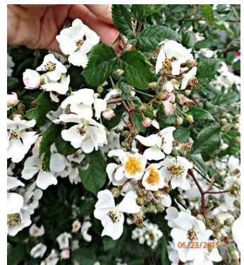
Multiflora rose.

Multiflora rose is capable of creating dense thickets that crowd out other vegetation, and its thorny branches snag on clothes and skin. Like many of the species we’ve discussed, multiflora rose continues to spread with the help of birds.