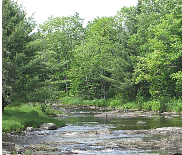
B Stream in Houlton.

If you're planning to build a house or a nature trail near a waterbody, some planning is necessary to prevent or minimize erosion. Any