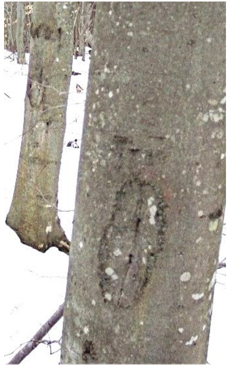
Old tree blazes.