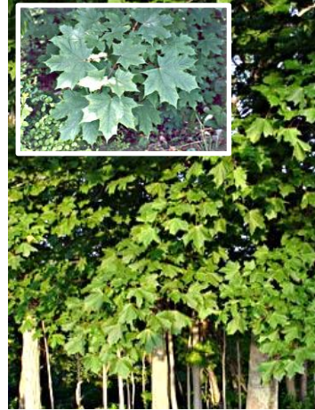
Norway maple tree and leaves.

'Crimson King' is a cultivated variety of Norway maple that has purple-red colored leaves and is often (incorrectly) referred to as red maple. Although the sale of any type of Norway maple is prohibited in Maine , the 'Crimson King' is somewhat common throughout the state.