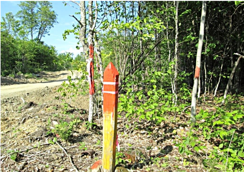
Corner post.