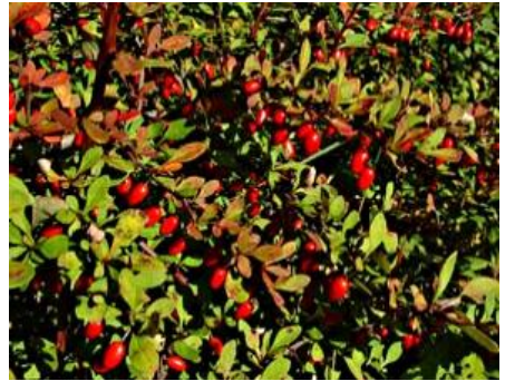
Japanese barberry.

Japanese barberry ( Berberis thunbergii ) is a woody shrub with numerous arching spine-bearing branches. This plant was a popular ornamental, because the leaves turn striking shades of red and orange in the fall. It usually grows about three feet high but can reach up to six feet.