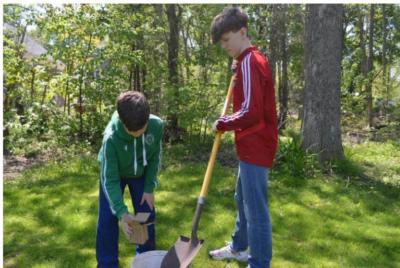
Gathering soil for a soil testing kit.

To get an even better understanding of the soils in your woods, you can get a soil testing kit from the University of Maine Cooperative Extension offices (see Primary Resources, page 5). It is inexpensive and easy to send soil samples to the lab for analysis. A great benefit of the analysis is the recommendations you will receive to improve the soil for the plants you specify.